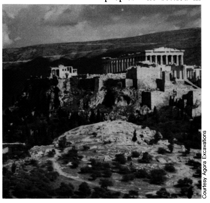
Mars Hill in Athens (foreground), is where Paul preached to the curious Greek philosophers.

Beginning with the tower of Babel, God caused the nations to migrate out of the regions He intended for them. The descendants of Japheth primarily migrated to the eastern part of the world called the Orient. The descendants of Ham are the black peoples who settled in