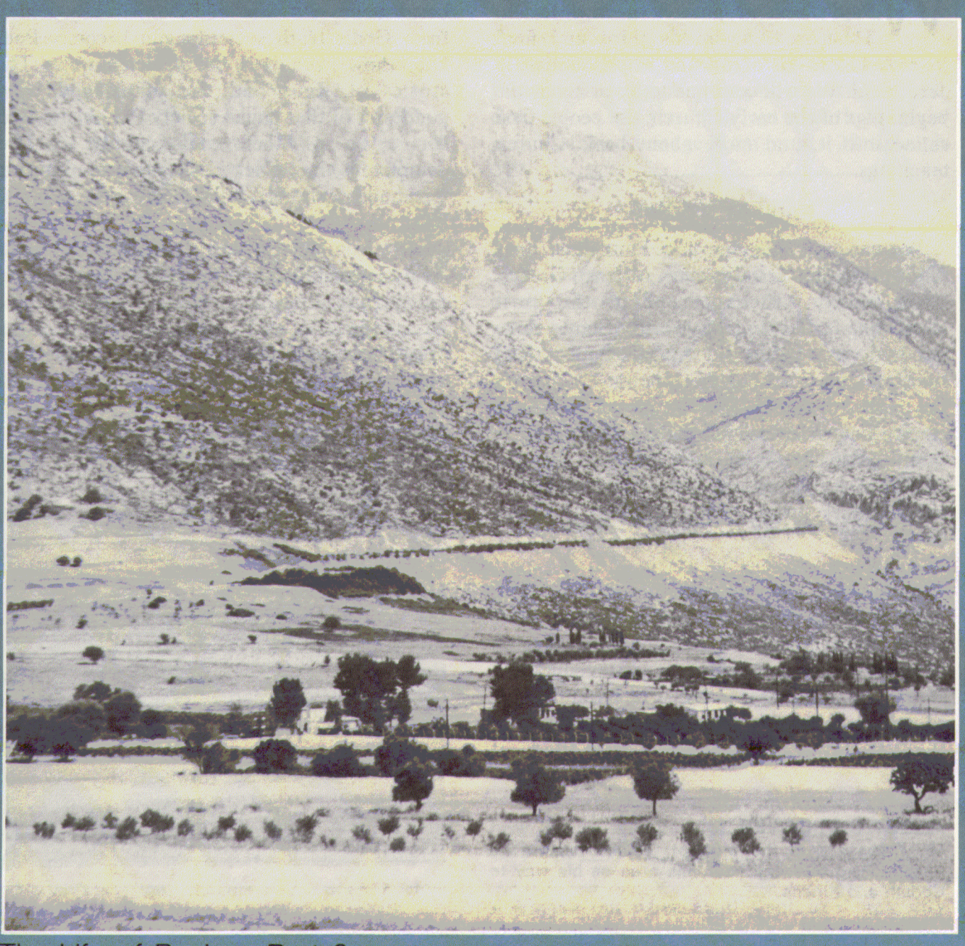
The Life of Paul - Part 3